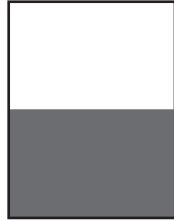
Horizontal Half Page (7 x 4-5/8 Inches)